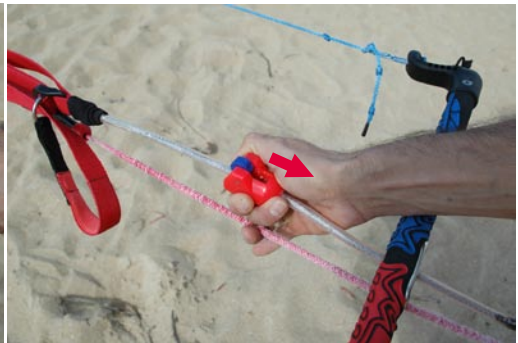
Unlocking the S.L.S